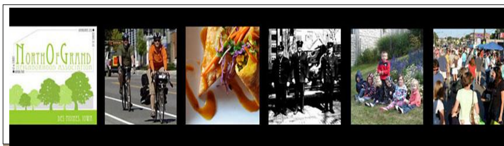
NOG Newsletter Fall 2013 Issue